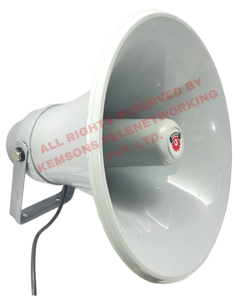
MODEL NO: KTPLWPSPK-02

TELENETWORKING KEMSONS WEATHERPROOF HORN LOUDSPEAKER are designed to organize local systems of loudspeaking technological communication, public address and security at production sites and open areas. They are used in conditions of extremely low and high temperatures, have a high level of protection against moisture and dust (IP66). All-weather loudspeaker enclosures are made of toughened ABS. They are highly durable, resistant to vibrations and mechanical damage, corrosion, salt fog and prolonged exposure to UVC. All-weather loudspeakers are used for sound notification - broadcasting voice information or alarm signals in industrial areas and open areas with a high noise level. Their applications industrial enterprises are metallurgy, woodworking, thermal and hydroelectric power plants, drilling platforms, objects of construction and urban infrastructure - stadiums, playgrounds,